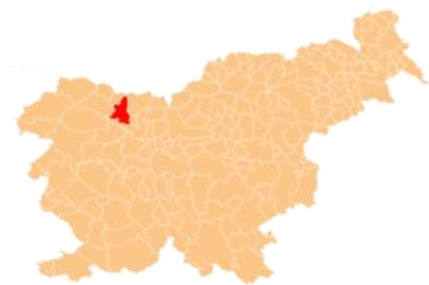
SLOVENIA - RADOVLJICA