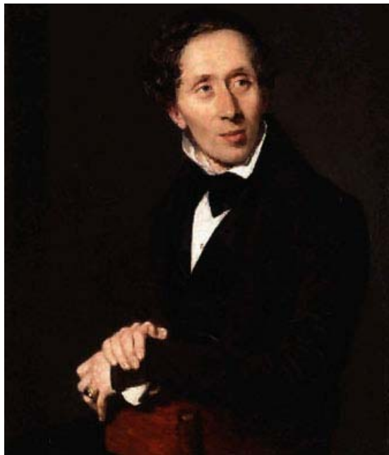
Hans Christian Andersen

www.biografiasyvidas.com/biografia/a/andersen.htm