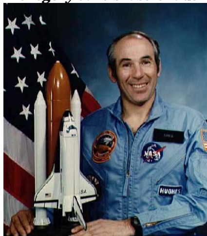
Gregory Jarvis- astronaut

Some of us also have a username which is used to gain access to private or important things. Next to username we must usually also know a password which is used to make private or important things secured. I use a few different passwords but I know none of them is really safe. I do not have any really important things, which should be protected.