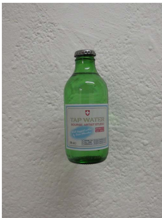
Tap Water (Zurich), 2009