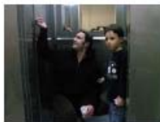
New Hope 2006 Goethe-Institut, Sofia