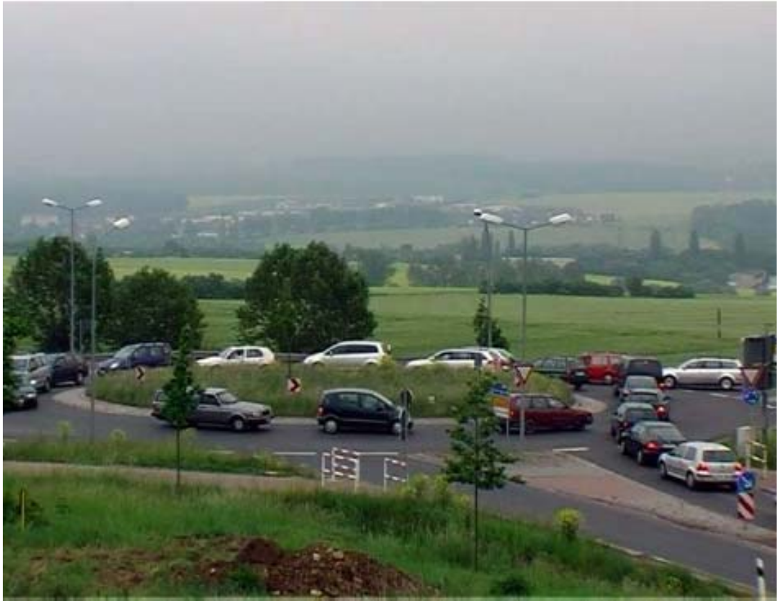
14:13 Minutes Priority (Weimar), 2005 Performance, Video still.