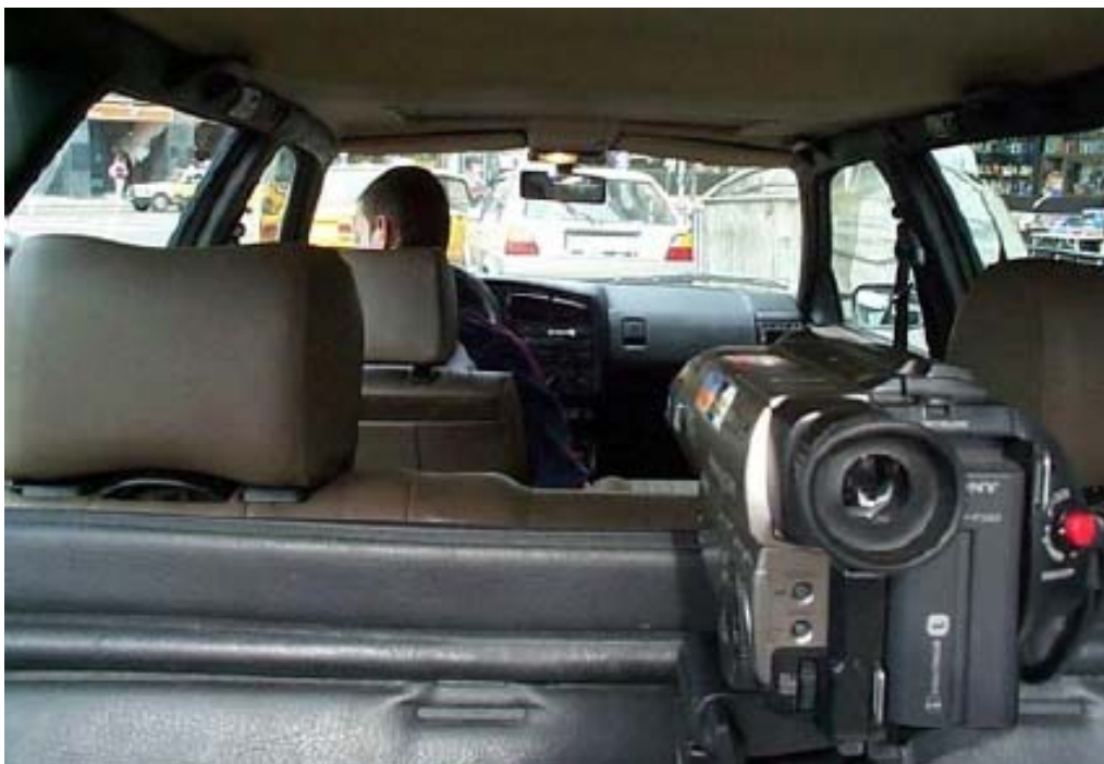
One Hour Priority, 2000 Video transferred on DVD, sound, 60 min