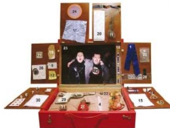
Fragments (Box #4), 2005-2007