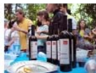
Czech & Slovak Republic