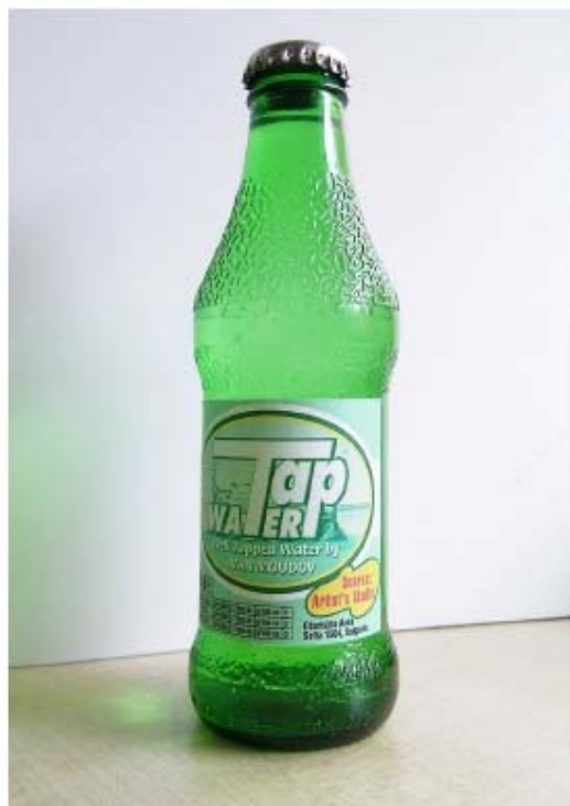
Already Made 2 (tap water), 2007 16.5cm/ 5.5cm, 7 glass bottles with tap water (Sofia)