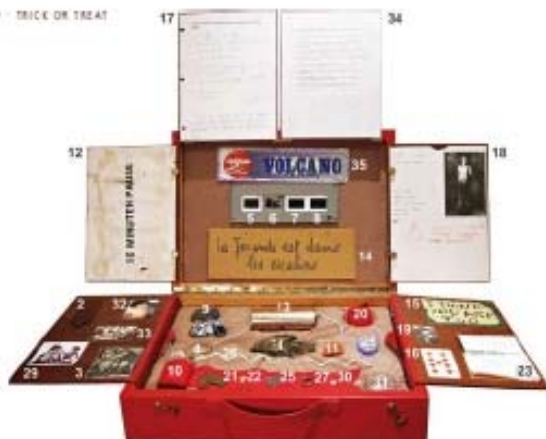
Fragments (Box #1), 2002–2004