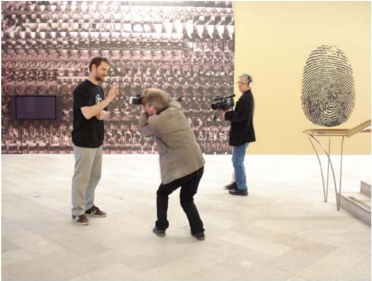
Romanian Trick, 2008 Performance, Moderna Museet Stockholm