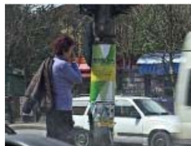
MUSIZ, 2005 Invitation for the opening of the Museum for Contemporary Art, Sofia