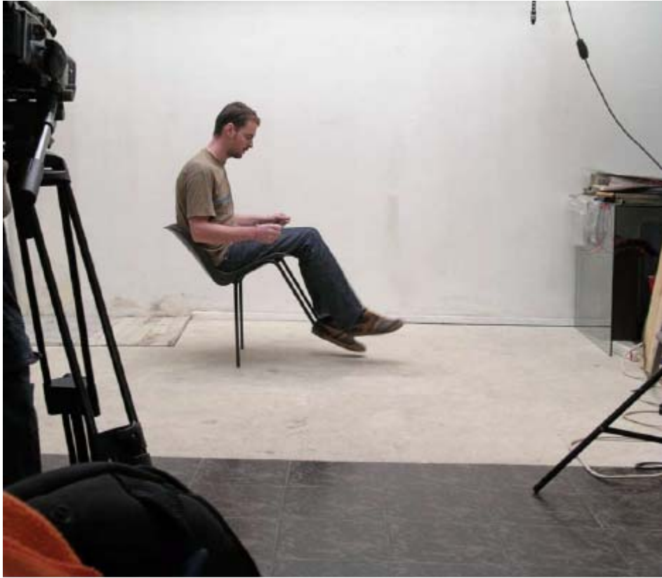
Teleporting Machine, 2005 Video transferred on DVD, silent, 7.25 min.