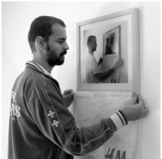
Already Made 4 (Timm Ulrichs), 2008 Instalation view, Moderna Museet, Stockholm B&W photography, wooden frame