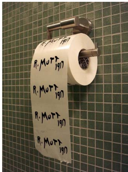
Already Made 3 (pissoir), 2008

Instalation view, Moderna Museet, Stockholm (Ladies Room) 100cm/32cm, glass bottle, tube, urinal