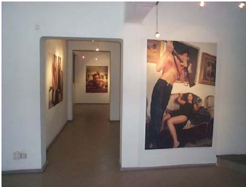
Still Life, 2000 Ink-jet prints, various size