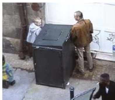
4, rue Ste Catherine, 2002. Video transferred on DVD, no sound, 35 min.