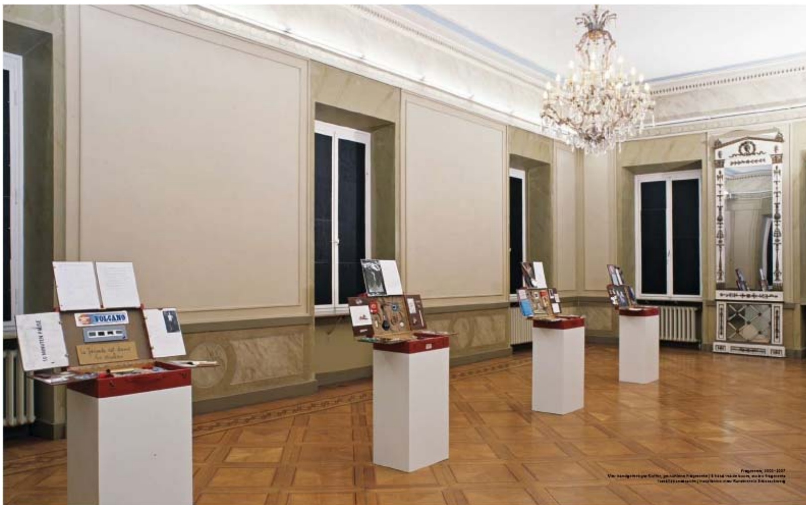
Fragments, 2002 – 2007,

"Since 2002 I have been collecting parts of different artworks from various museums, galleries and art centres in Europe. I made these suitcases in order to have my collection with me everywhere I go and to be able to show it to everyone who might wish to see it. It is my portable museum and Noah's Ark."