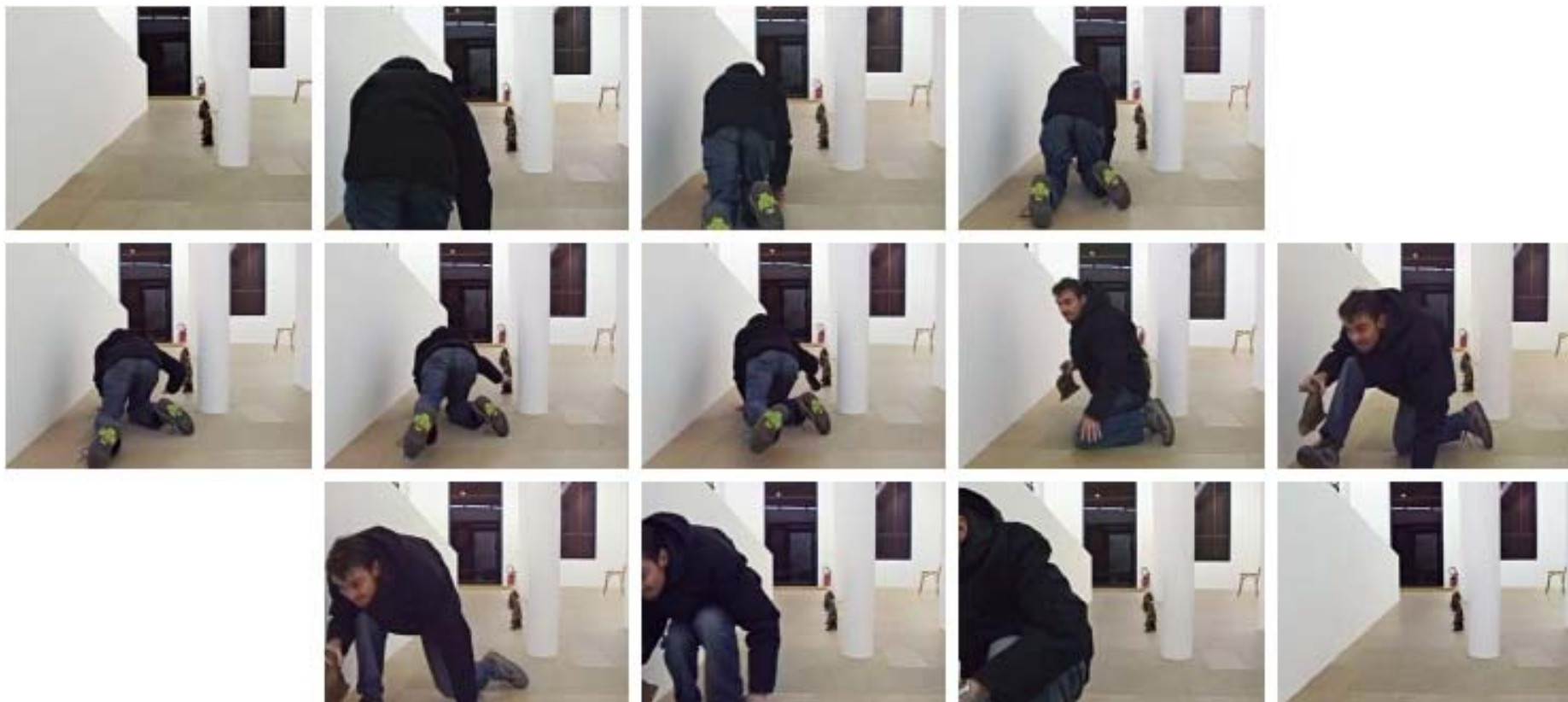
Fragment (IAC Lyon, 10.01.2003), 2003 Video documentation, DVD, 0:57 min