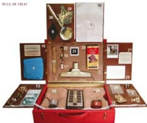
Fragments (Box #2), 2005