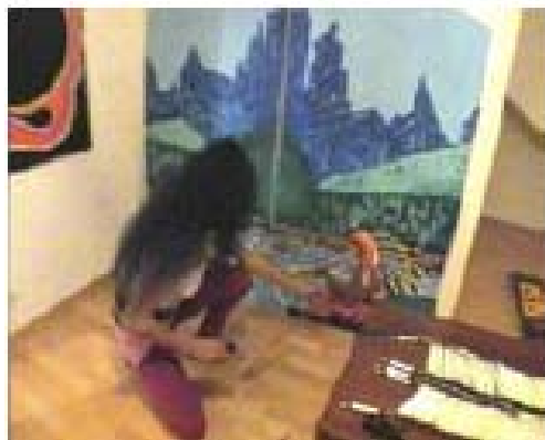
Buffalo, 2001. Video transferred on DVD, sound, 19 min. Video still