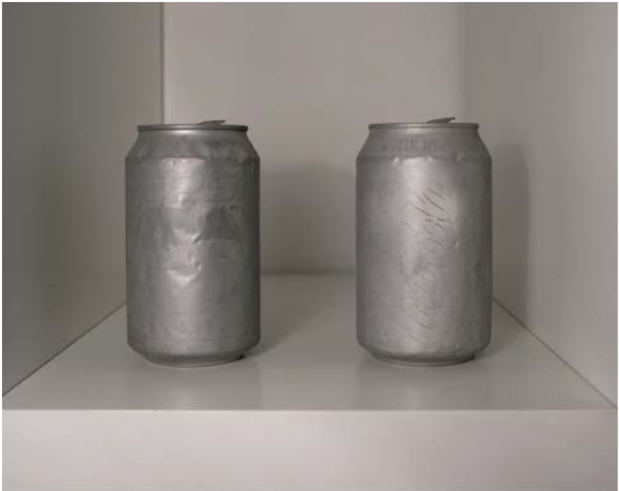
Already Made 1 (cans), 2007 100cm/79,55cm, digital print backed onto aluminum