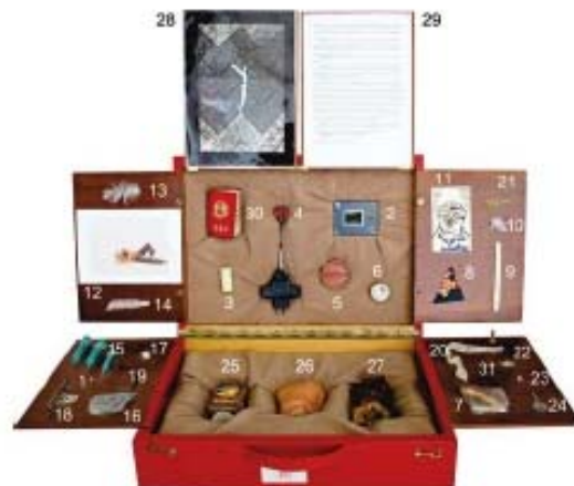
Fragments (Box #2), 2002–2007