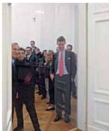
The Glass , 2008 Installation view Kunstverein Braunschweig