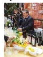
Republic of Korea