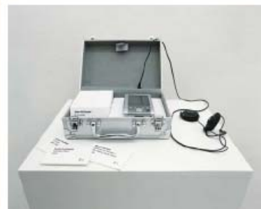
Guide, 2006 Audio guides, labels Installation view Studio Tommaseo, Trieste below: Installation view Centre for Contemporary Art, Plovdiv, 2006