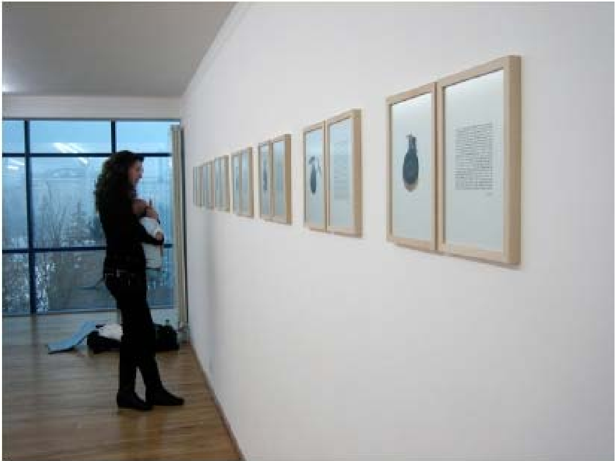
Already Made 5 (One Week Coffee Self-portraits), 2007

Series of 14 inkjet prints on paper, 32 x 23.4 cm each (framed)