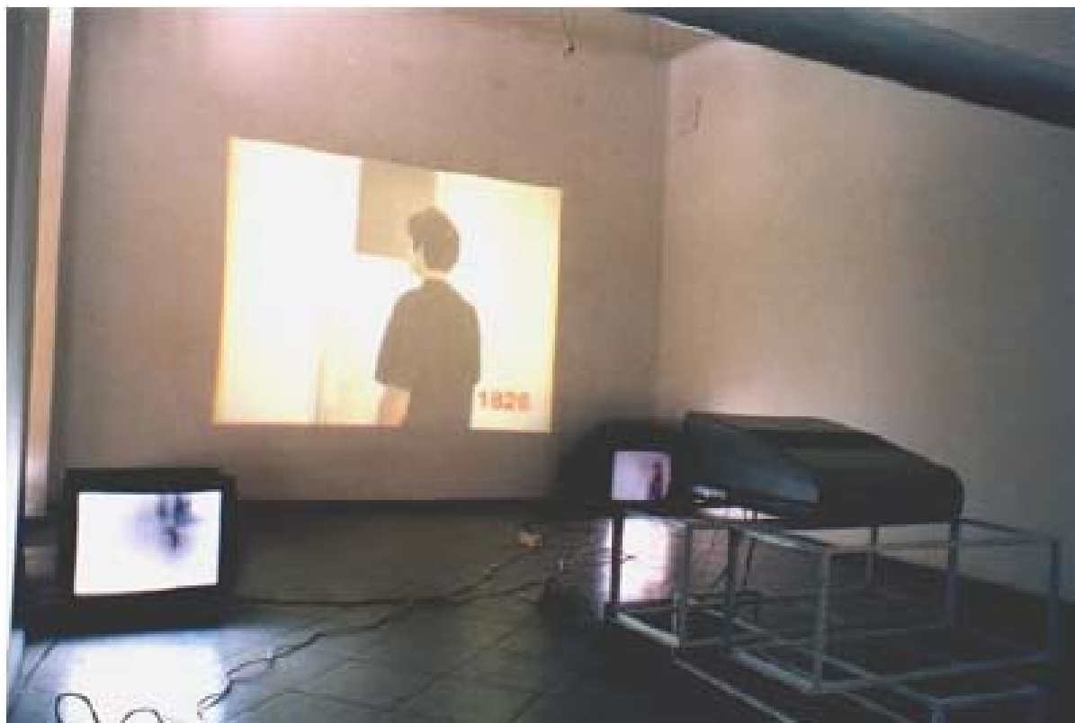
The 2000 Syndrome, 1998 Installation, ATA Center for Contemporary Art, Sofia