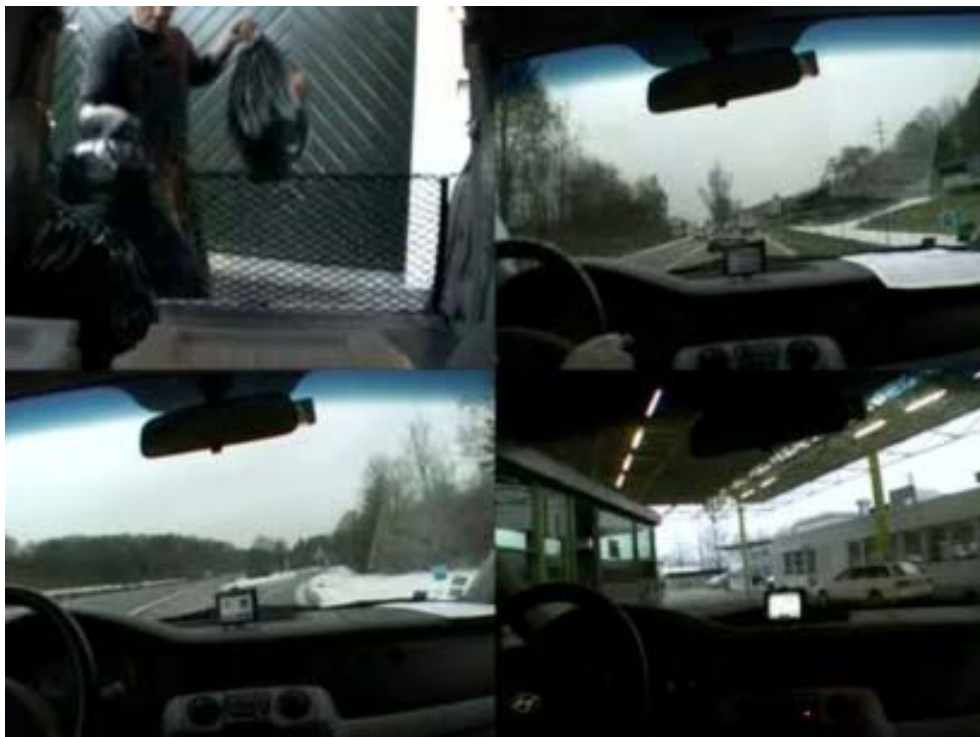
Garbage, 2009 4-channel video, 60 Min. loop. Installation view, Binz 39, Zurich