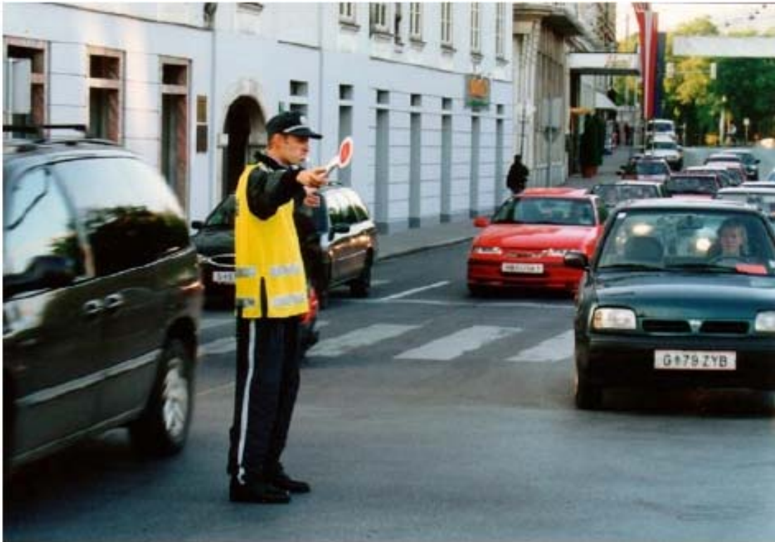
Traffic Control, 2001 performance, video, 22 min Graz