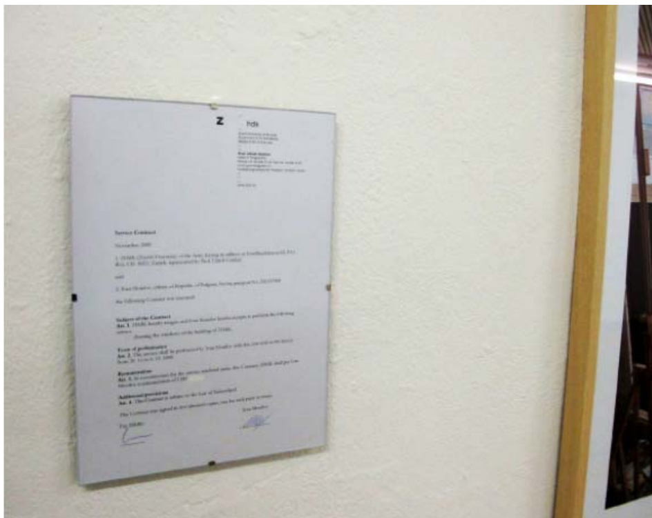
The More You Know The More You See, 2009 Installation view, Binz 39, Zurich 2 Photographs, Contract