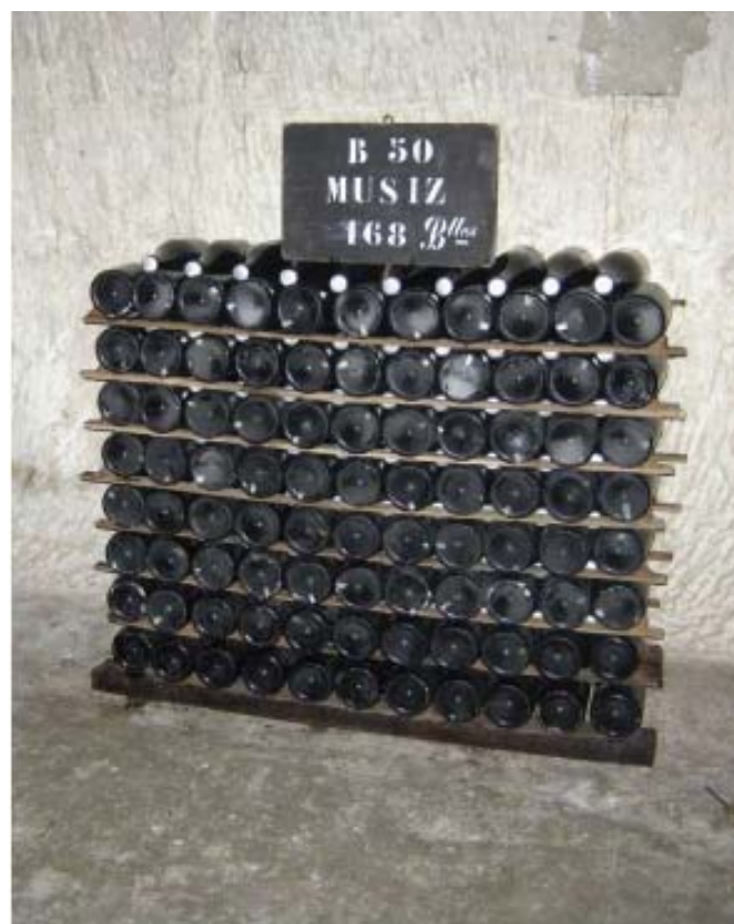
MUSIZ (Champagne Pommery for the Grand Opening of MUSIZ Museum of Contemporary Art – Sofia), 2008

Work manufactured by Pommery S.A. and for the Exhibition «L'Art en Europe : Expérience Pommery#5»