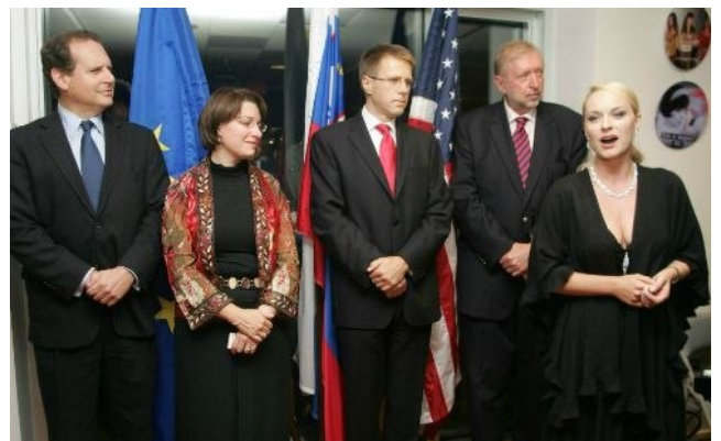
Senator Klobuchar, Congressman Lincoln Diaz Ballart, minister Rupel and Ambassador Žbogar during the performance of Sabina Cvilak.