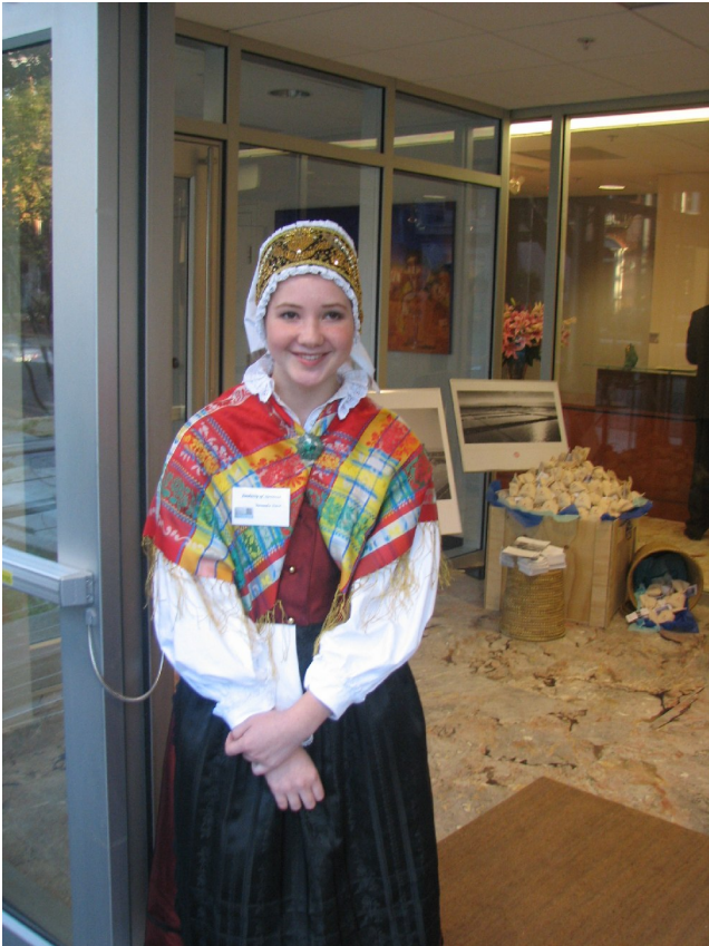
Warm welcome awaited guests at the entrance...