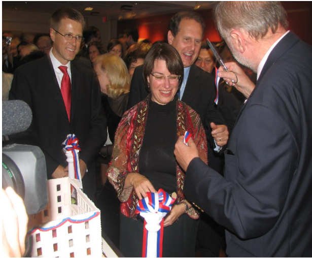
Minister Rupel cutting the ribbon with Senator Klobuchar, Congressman Lincoln Diaz Ballart and Ambassador Žbogar.