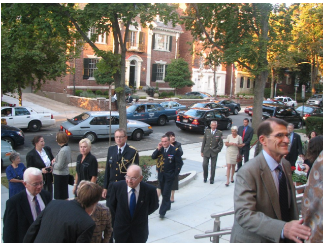
While the guests were arriving....