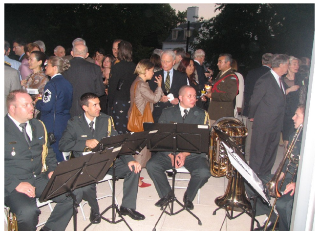
Members of the Armed Forces and Police Band.