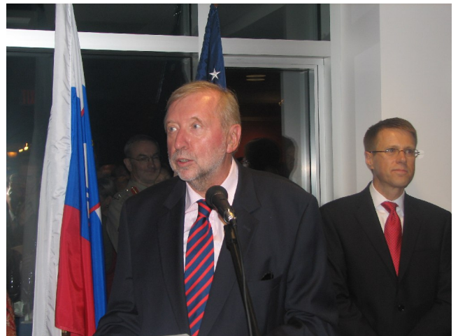
Minister Rupel during his speech.