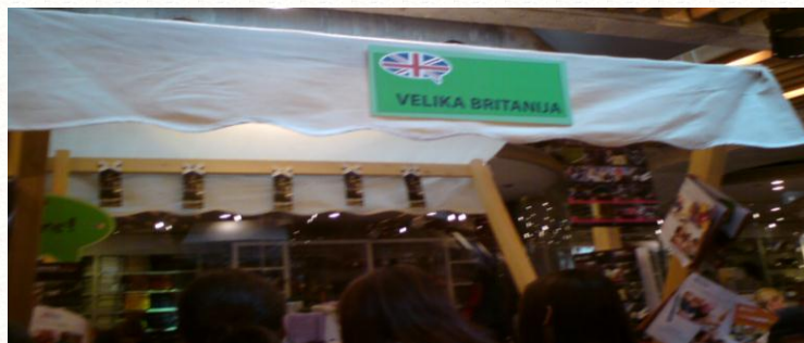
Great Britain stall, Foto: E.S.