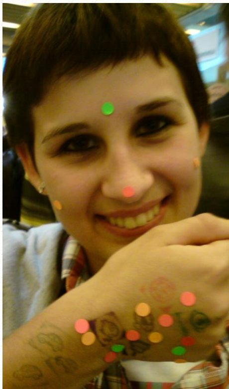
Collecting stamps for a price