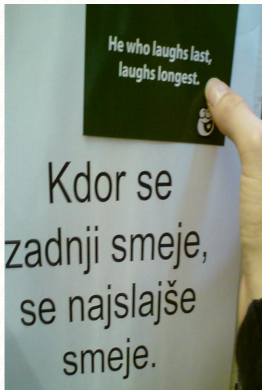
Collecting cards with proverbs