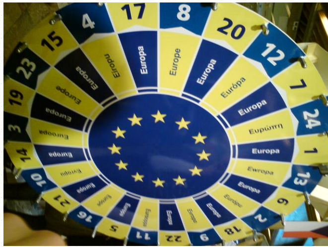
One of the games, Foto: E.S